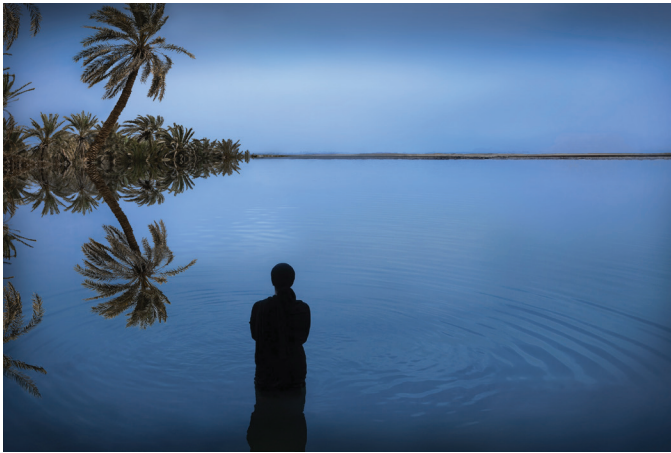
SAMA ALSHAIBI, BIRKET SIWA FROM PROJECT SILSILA, 2014, DIASEC, 166 X 250 CM.